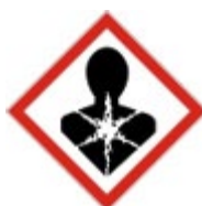
GHS08 Health hazard