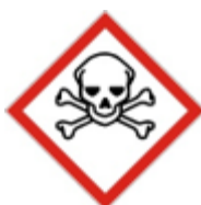
GHS06 Acute toxicity